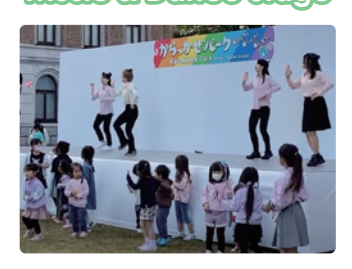
Come and sing and dance together!

Hula dancing, Celtic folk songs, Indian and Nepalese dances, Ukulele performances, and more (about 12 participating organizations)